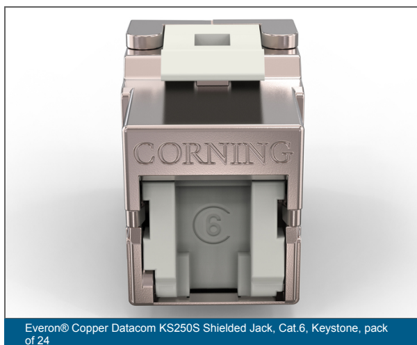
Everon® Copper Datacom KS250S Shielded Jack, Cat.6, Keystone, pack of 24

Seamless connectivity, regardless of mismatched connectors (RJ11/12)