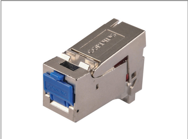
Everon® Copper Datacom xs500 Copper jack, Cat.6A, Keystone, AWG 22-24, bulk pack (24 pcs.)