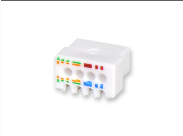
Everon® Copper Datacom xs500 Copper jack, Cat.6A, Keystone, AWG 22-24, bulk pack (24 pcs.)