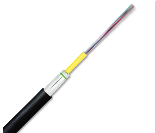
Part Number: 024EEU-13122A2G