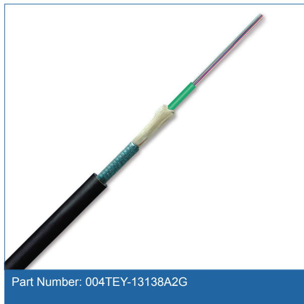
Part Number: 004TEY-13138A2G