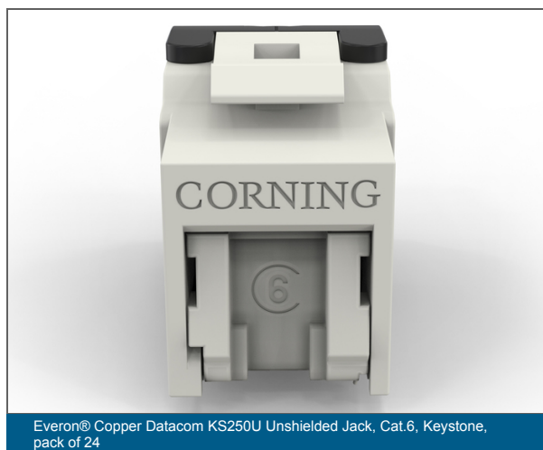
Everon® Copper Datacom KS250U Unshielded Jack, Cat.6, Keystone, pack of 24

Tested and approved for Power over Ethernet applications