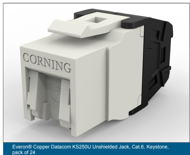
Everon® Copper Datacom KS250U Unshielded Jack, Cat.6, Keystone, pack of 24